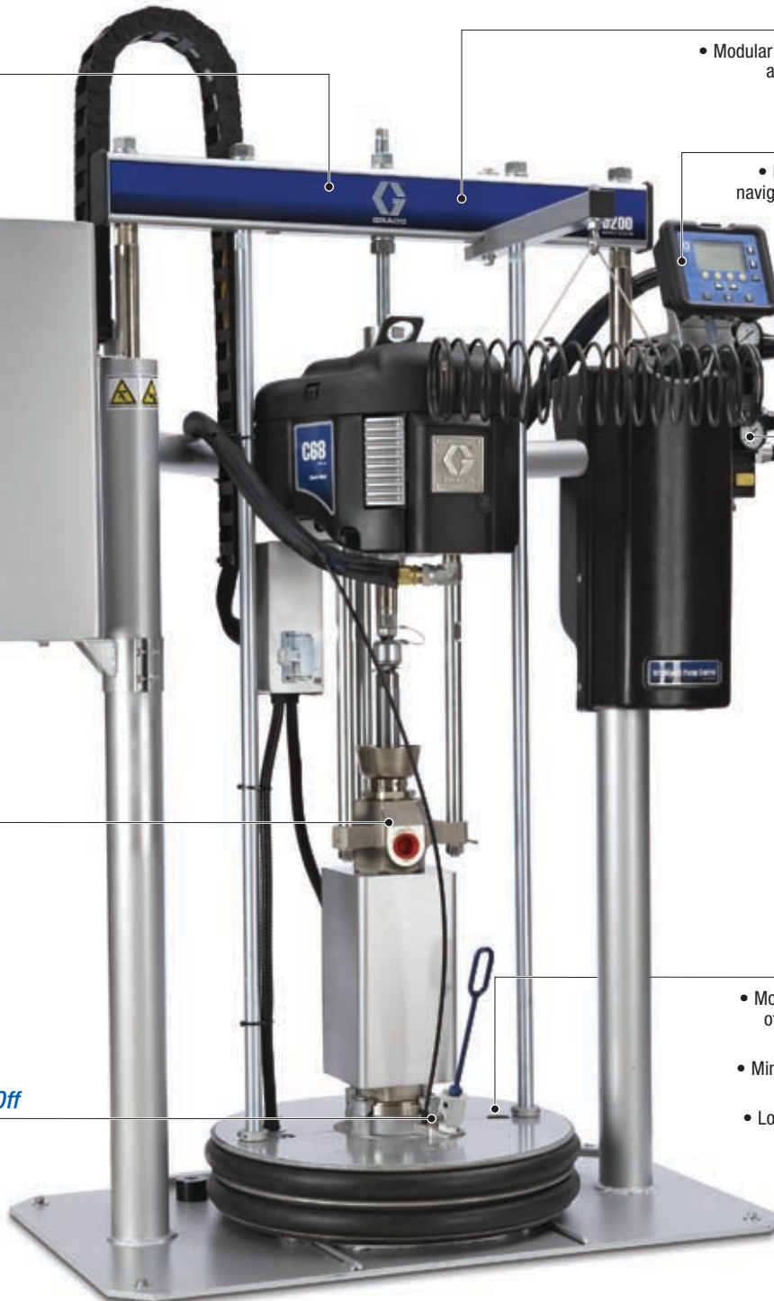
Graco Warm Melt Supply System